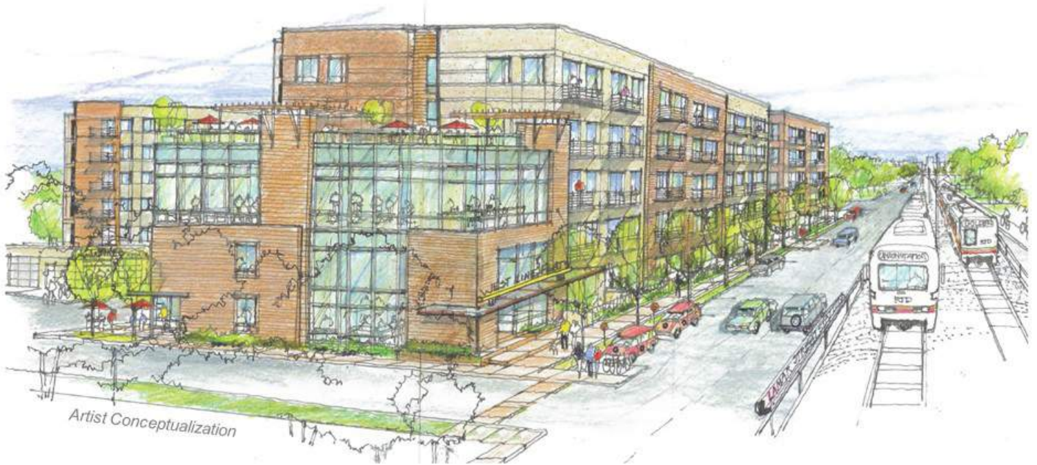
West Line Flats, 155 residential units with its own dog park and loads of other millennial-friendly amenities, is under construction ½ block from Lamar Street Light Rail Station.