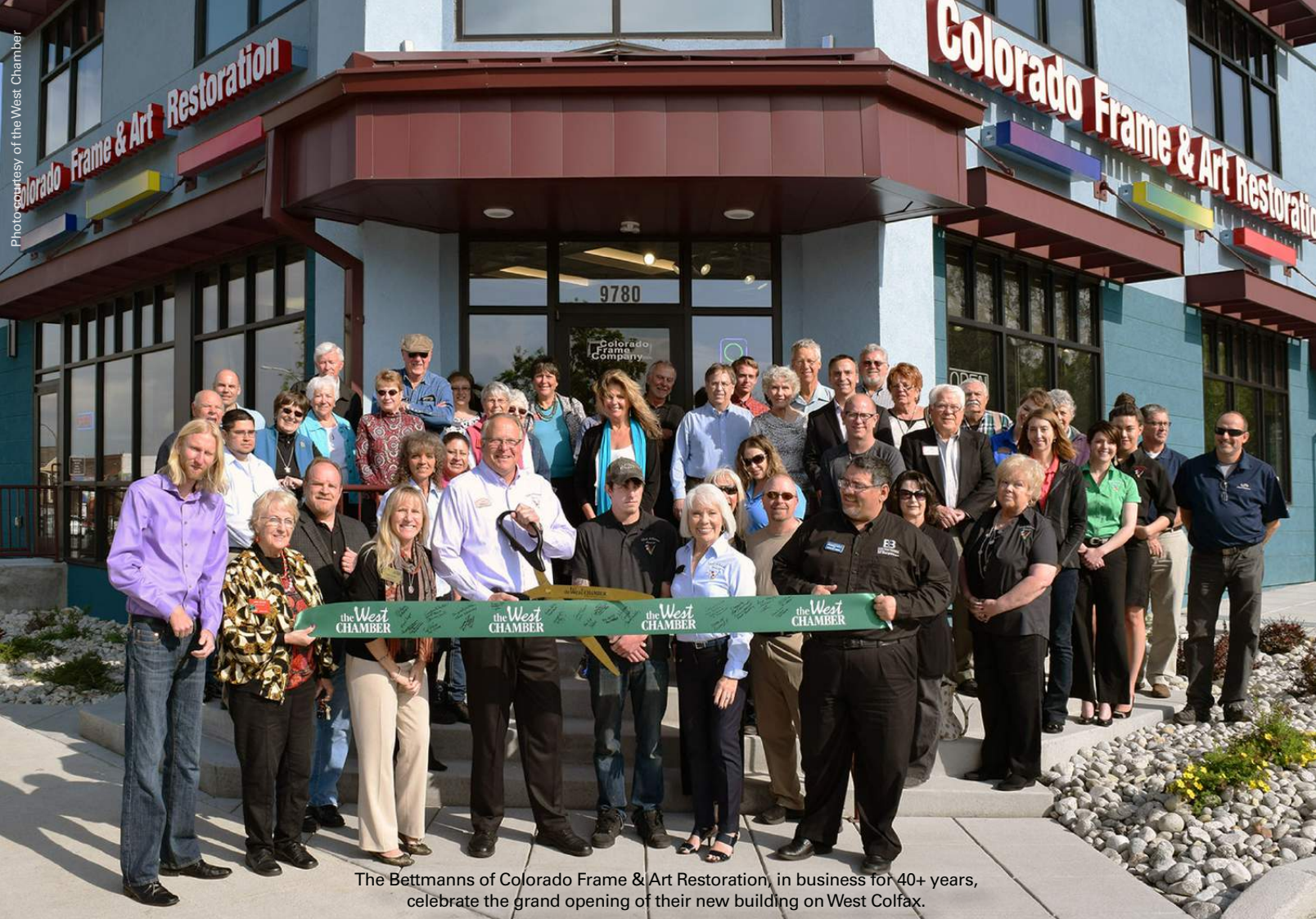
The Bettmanns of Colorado Frame & Art Restoration, in business for 40+ years, celebrate the grand opening of their new building on West Colfax.