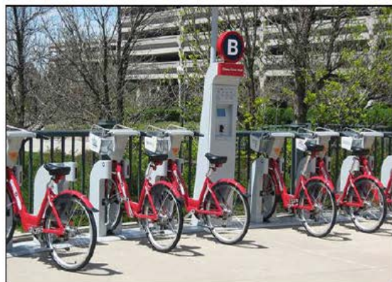
B-Cycle Bike Share Station