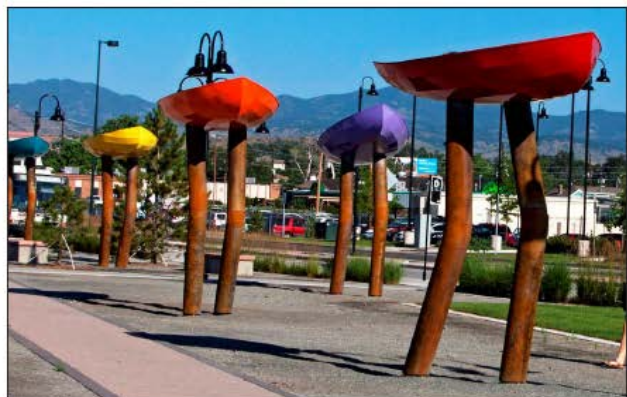
Public Art at Oak Street Station / “Walking Boats” by Joshua Wiemer