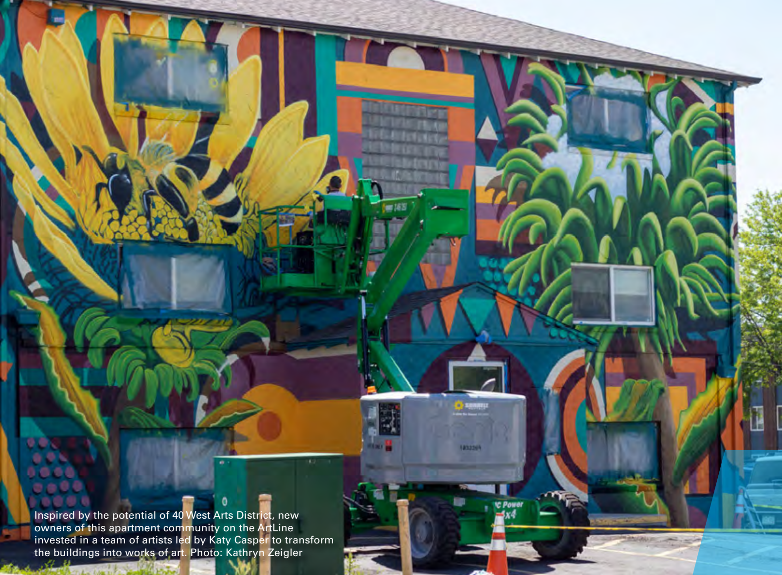
Inspired by the potential of 40 West Arts District, new owners of this apartment community on the ArtLine invested in a team of artists led by Katy Casper to transform the buildings into works of art.

In fact, in addition to the pragmatic approach of identifying goals and action items related to the focus areas, the 2040 Plan integrated elements of storytelling, including numerous visuals, revealing sidebars, and illuminating "What if" lists that enumerated dreams for the future.