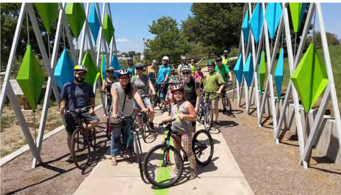
A bike tour of the 40 West ArtLine starts at Mountair Park signature art installation “Dermal Plate Gateway” by PUNCH.