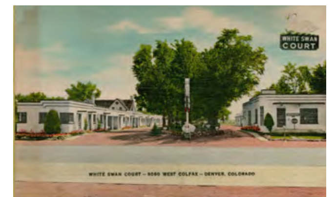
Richardson found a vintage postcard of the White Swan, located at 6060 West Colfax Avenue.