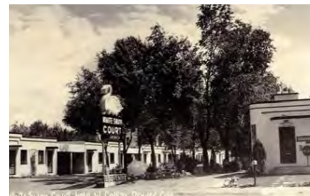
The White Swan Court, a classic mid-century motor inn, opened in 1945.

By architect Nicole Delmage of ShelterBelt Design